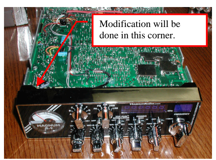
Figure 1: Solder Side of Radio

With the top cover removed and the solder side facing up, see Figure 1.